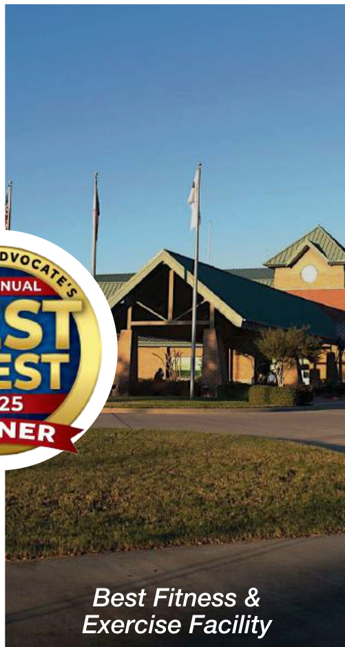
Best Fitness & Exercise Facility

Thank you for voting us BEST OF THE BEST