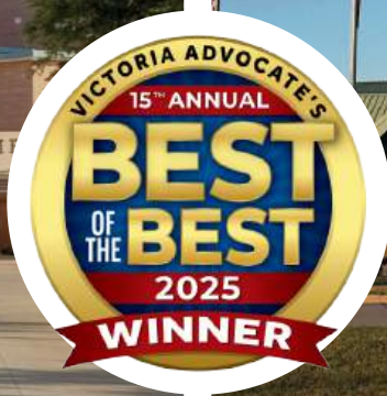
Best Hospital & Emergency Room